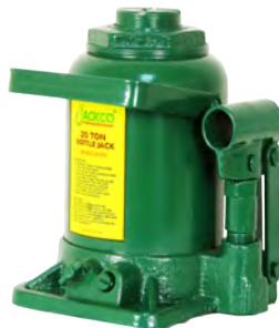
61121 20 Ton