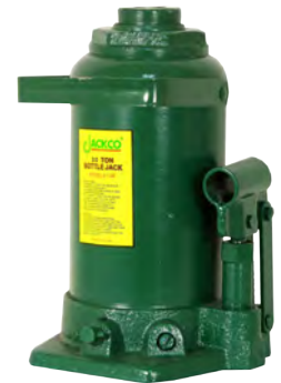
61130 30 Ton

**Low-profile 12 ton and 20 ton models are designed for low clearance vehicles and confined work places