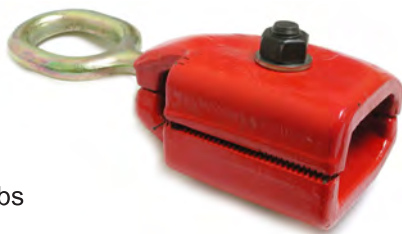
Model 18320 Underbody Support Clamp

Rotates 135° Capacity: 3 Ton Shipping Weight: 9 Lbs