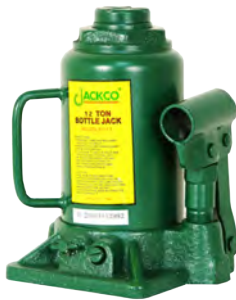
61113 12 Ton