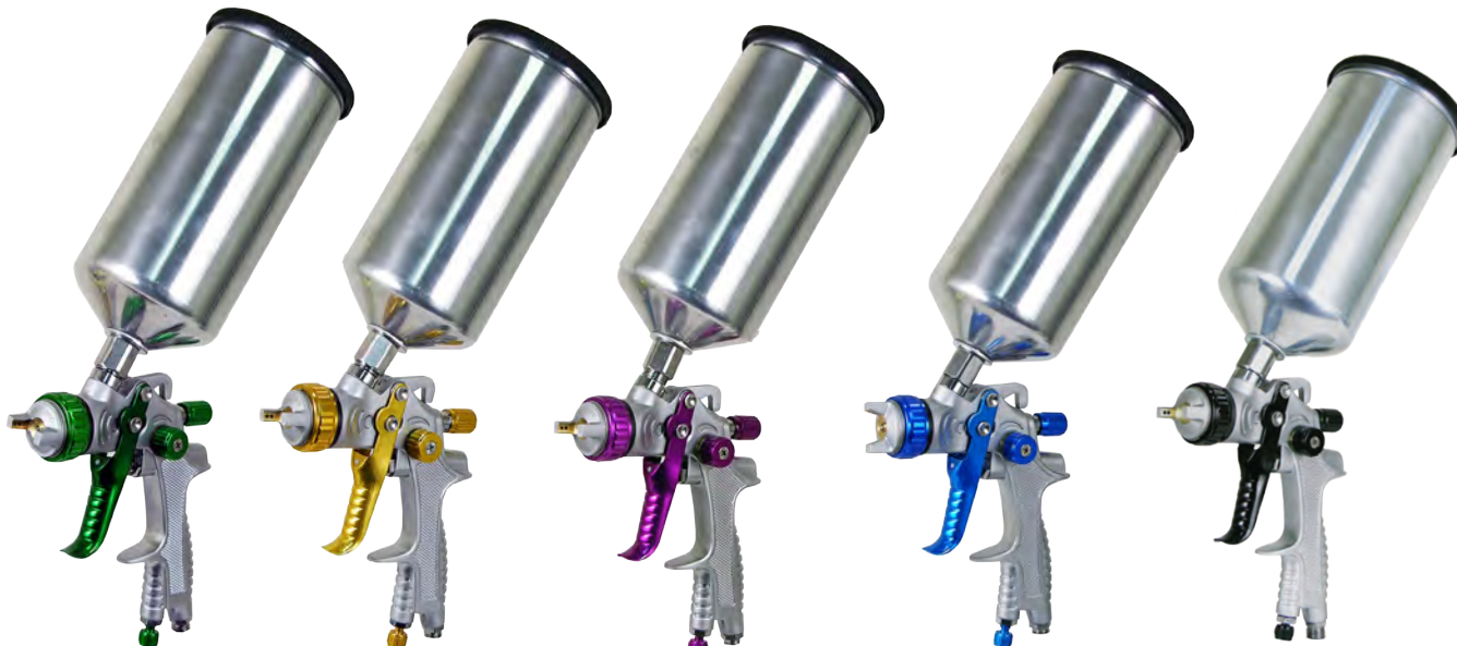
Model PN10250 1.3mm Green Tip