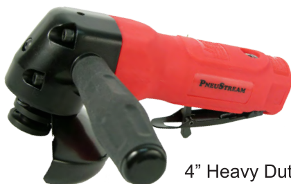
4" Heavy Duty Grinder