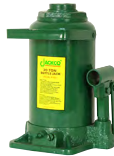
61122 20 Ton