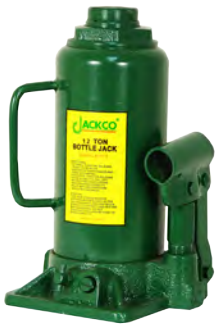
61112 12 Ton